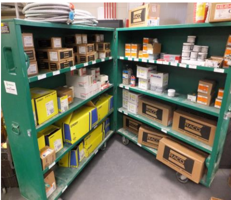
Echo Group onsite clamshell.

Our ESO team will work with you to tailor fit a solution to fit almost any distribution challenge.