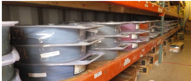
Onsite container storage with coil-packs.

Contact your local ESO representative to review the needs and requirements of your job. The ESO team will then review the data, and work with you to custom fit a solution to make the job a success!